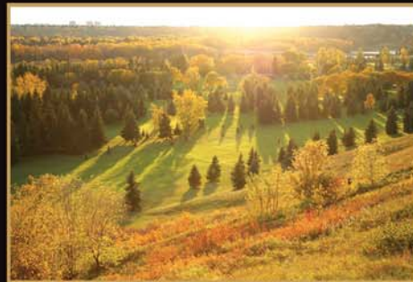
Victoria Golf Course, minutes away from the Bentley.